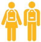
TRADITIONAL IN-PERSON LEARNING

Piedmont Public Schools leadership team, with assistance from our PPS Educator Leadership Council, PPS parent volunteers, district nurses, health professionals, and the State Department of Health, has established a multi-faceted plan for the 2020-21 school year. This plan includes: