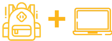
HYBRID LEARNING ENVIRONMENT