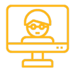
FULLY-ONLINE LEARNING PLATFORM

The well-being of our students and staff is our top priority. We are highly aware regulations and situations concerning COVID-19 are changing daily. The plans we have in place now can rapidly change as community spread increases. If we are required to change our plans, we will communicate those changes with you by email, our website, phone call, and social media platforms. As we navigate and make choices that impact our school community, we are appreciative of your flexibility, patience, and support.